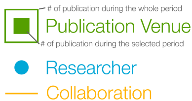
Figure 2. Graph elements in Collaboration Map.